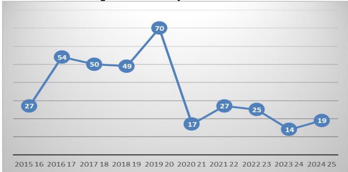
Table 6. Fraud Investigations Closed by Year